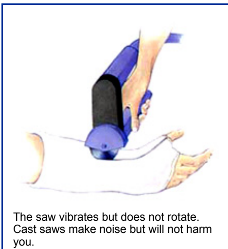
The saw vibrates but does not rotate. Cast saws make noise but will not harm you.

After the initial swelling has subsided, proper splint or cast support will usually allow you to continue your daily activities with a minimum of inconvenience.